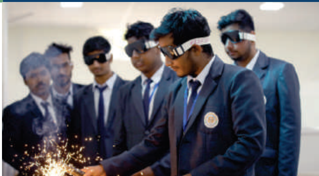
FACULTY OF ENGINEERING AND APPLIED SCIENCES