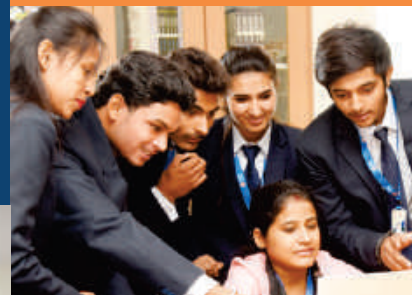
FACULTY OF SOCIAL SCIENCE AND HUMANITIES