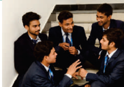
FACULTY OF COMMERCE AND MANAGEMENT