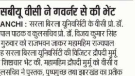
एसबीयू वीसी डॉ. गोपाल पाठक ने गवर्नर से की भेंट का आयोजन किया।