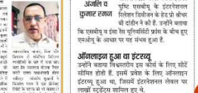
ऑनलाइन माध्यम से 'रचनात्मक लेखन' पर एक वेबीनार का आयोजन किया गया।