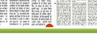
25 जून को इंटरनेशनल योगा कॉन्फ्रेंस का आयोजन किया जायेगा का आयोजन किया गया।