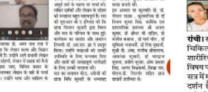
सला बिरला विश्वविद्यालय में योग सम्मेलन सपन्न का आयोजन किया गया।