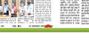
सला बिरला विश्वविद्यालय में रचनात्मक लेखन पर वेबीनार का आयोजन किया गया।