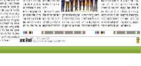
ऑनलाइन माध्यम से 'रचनात्मक लेखन' पर एक वेबीनार का आयोजन किया गया।