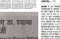
याद किए गए डॉ. श्यामा प्रसाद मुखर्जी का आयोजन किया गया।