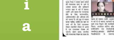
सला बिरला विश्वविद्यालय रंची के मानविकी और भाषाशास्त्र संकाय द्वारा ऑनलाइन माध्यम से रचनात्मक लेखन पर एक वेबीनार का आयोजन किया गया।