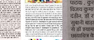
25 जून को इंटरनेशनल योगा कॉन्फ्रेंस का आयोजन किया जायेगा का आयोजन किया गया।