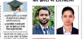
विश्वविद्यालय शिक्षकों की नियुक्ति में पीएचडी अनिवार्य का आयोजन किया गया।