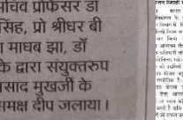
जाना बनते समय यथावधि ना चाहिए: जयदीप मुखर्जी का आयोजन किया गया।