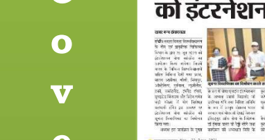
सला बिरला विवि में 25 जून को इंटरनेशनल योगा कॉन्फ्रेंस का आयोजन किया गया।