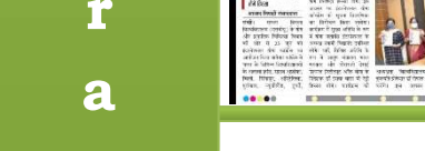
सला बिरला विश्वविद्यालय रंची के मानविकी और भाषाशास्त्र संकाय द्वारा ऑनलाइन माध्यम से रचनात्मक लेखन पर एक वेबीनार का आयोजन किया गया।