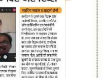
सला बिरला विश्वविद्यालय में रचनात्मक लेखन पर वेबीनार का आयोजन किया।