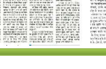
जाना बनते समय यथावधि ना चाहिए: जयदीप मुखर्जी का आयोजन किया गया।