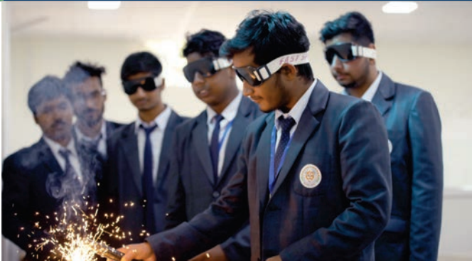
DEPARTMENT OF ENGINEERING & TECHNOLOGY