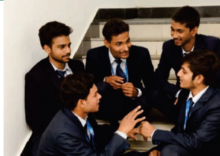
DEPARTMENT OF COMMERCE & MANAGEMENT