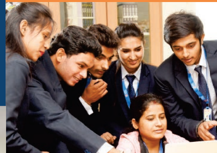
DEPARTMENT OF SOCIAL SCIENCE AND HUMANITIES